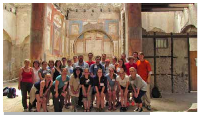
The 2014 Ancient Graffiti Project cohort in the House of the Augustales

use standard epigraphic conventions, and contribute to an international database. Technological methods such as RTI aided in photographing these graffiti so scholars from around the globe will be able to "view" the graffiti firsthand. In addition, each team, responsible for an individual insula, compiled a preservation report for their area. Beyond training participants as epigraphists and researchers in this area, work on this project has created advocates for the preservation of ancient graffiti.