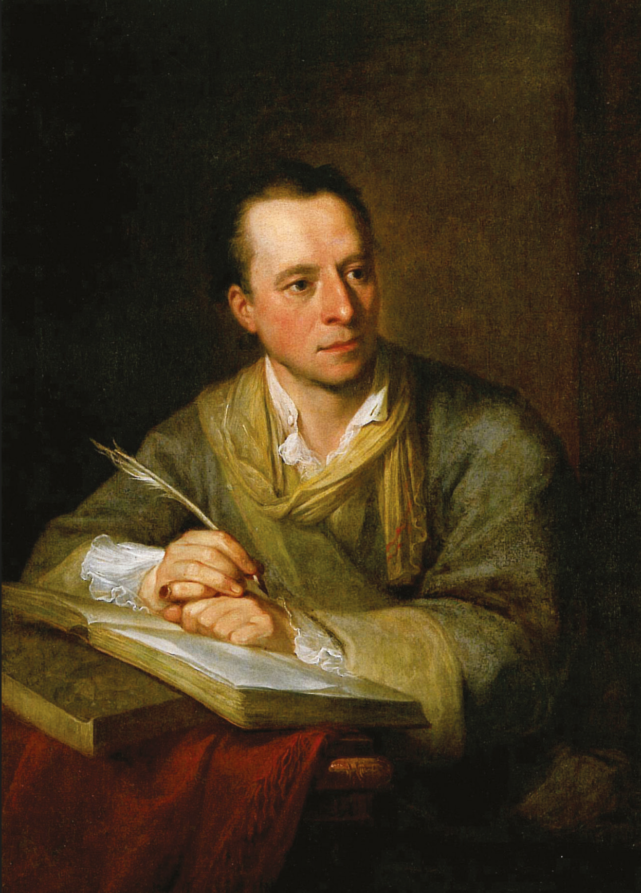
Johann Joachim Winckelmann by Angelika Kauffmann, 1764. Kunsthau Zürich

the newsletter of the Friends of Herculaneum Society - Issue 22 Autumn 2017