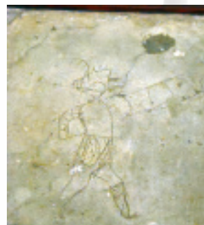
A graffito of a gladiator (probably a murmillo), stepping to the right and raising a large, rectangular shield—now on display in the Museo Archeological Nazionale di Napoli

I departed from Herculaneum on the same afternoon that the superintendent of Pompeii was announcing the recent discovery of the longest funerary inscription yet found there, which recorded the enormous sums spent by a local benefactor on gladiatorial games, banquets, and other benefits for the public. Since my research trip had begun with a detour from the theatre in Herculaneum, I interpreted this coincidence as a good sign that there was plenty more work for me to do next year in Herculaneum, Pompeii, and beyond, once I have finished writing up in my dissertation the data collected this year.