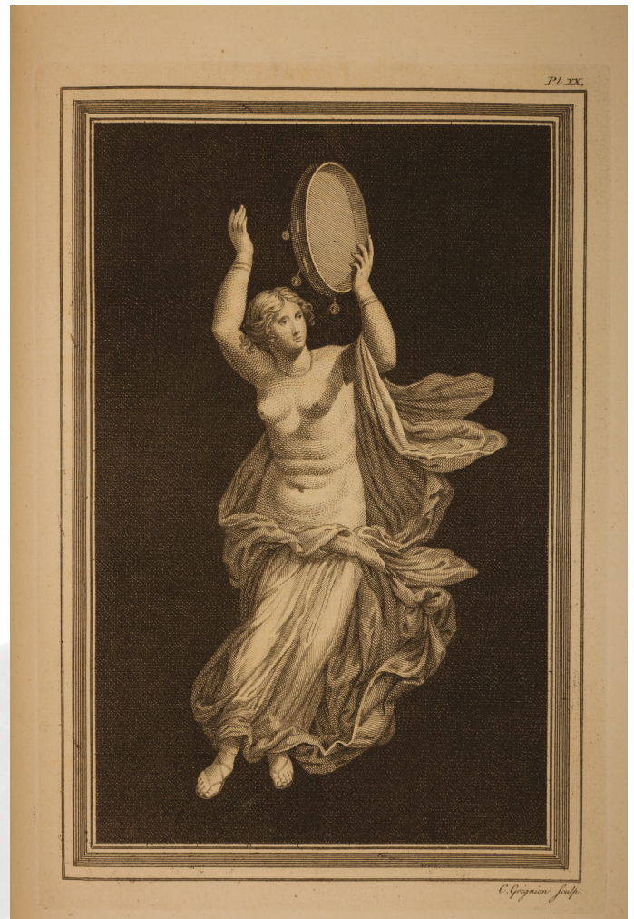
Wall-painting of a 'dancer' (maenad) with a tambourine, found in the Villa of Cicero, Pompeii. Engraved as Plate 20 of The Antiquities of Herculaneum , translated from the Italian by T. Martyn and J. Lettice; containing the pictures. London 1773.