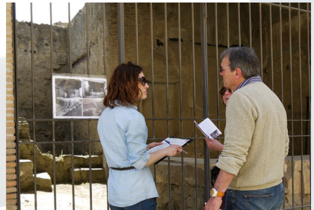
Visitors at the Bottega of the Plumbarius