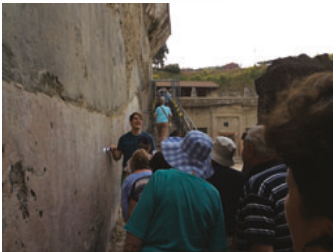
Shining a light on graffiti